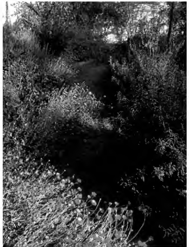
An overgrown path.

I don't get to the garden much during the week once daylight savings time ends. Come the weekend, though, that's where I'll be. I love to hear hummers "chipping," see what's growing, and smell the scent of leaves and dirt. I thank God, who provides this sensory perfume and brings me peace, joy, and comfort. 🌱